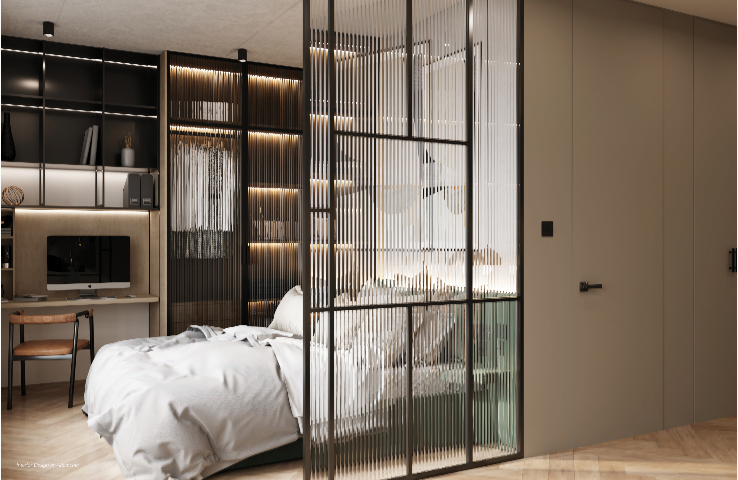
Interior Design by Ademchic