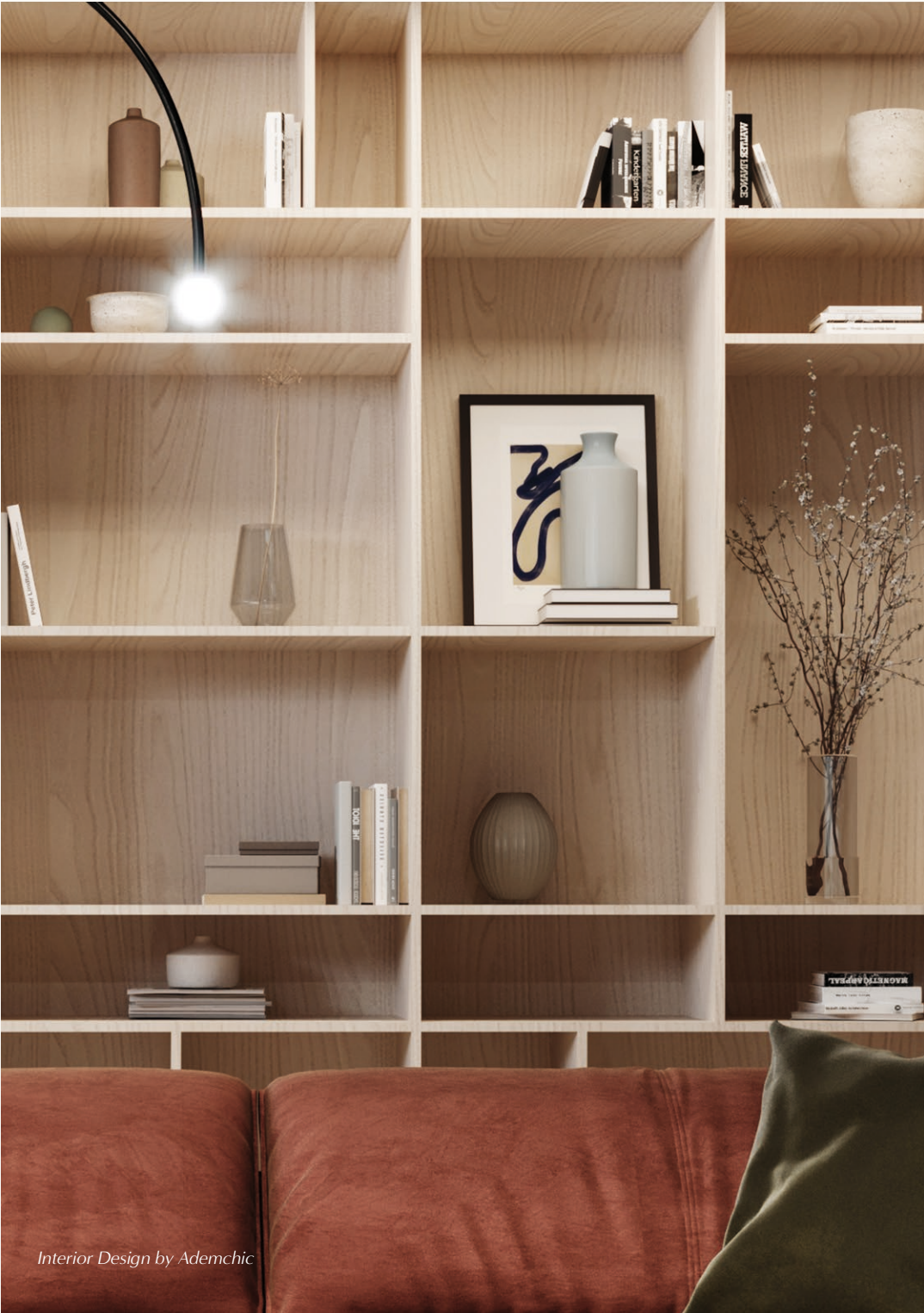
Interior Design by Ademchic

Fieldhouse Project Management delivers bespoke fit-outs in the UK under the Fieldhouse banner.